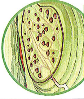
An Iron Age hillfort