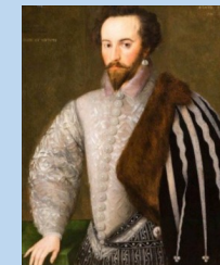
Sir Walter Raleigh

1552/4?- 29th October 1618 Adventurer and explorer Introduced tobacco and potatoes to England