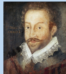
Sir Francis Drake

1540? - 28th January 1596 Explorer and slave trader Circumnavigated the globe