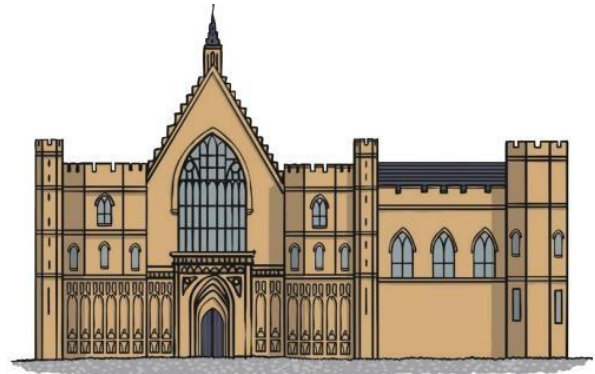
Houses of Parliament