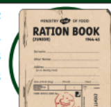
A ration book

Supply ships were targeted by German bombers and it was necessary to conserve as much food as possible. Rationing meant that each person was only allowed a fixed amount of foods. Ration books were issued, with coupons that showed people how much of each item they were allowed. Shopkeepers would remove or stamp the coupons when they were used. People were also encouraged to 'Dig for Victory' and grow as much of their own food as possible.