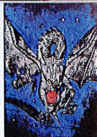
Charlie James – print workshop example

To book your class onto one of these very special workshops;