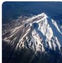
Mount Shasta 4,322 m