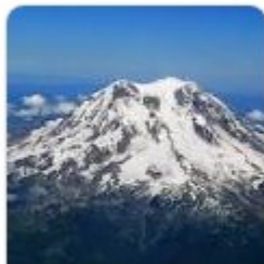
Mount Rainier 4,392 m