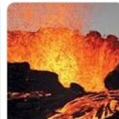
Mauna Loa 4,169 m