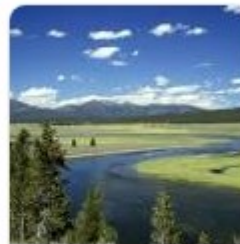
Yellowstone Caldera 3,142 m