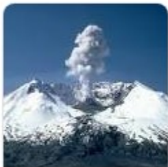
Mount Saint Helens 2,550 m