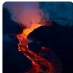
Kīlauea 1,247 m